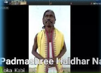
Padmashree Haldhar Nanda Loka Kabi