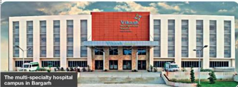
The multi-specialty hospital campus in Bargarh.

Staying positive and honest has always been his mantra of leadership and success. The ever-ambitious social entrepreneur never stops at this and aims for bigger things like opening a university in future. Another dream of his is to open a medical college. He also aims to provide affordable and quality school education in all the districts of Odisha.