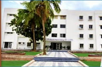
Vikash Degree College, Bargarh